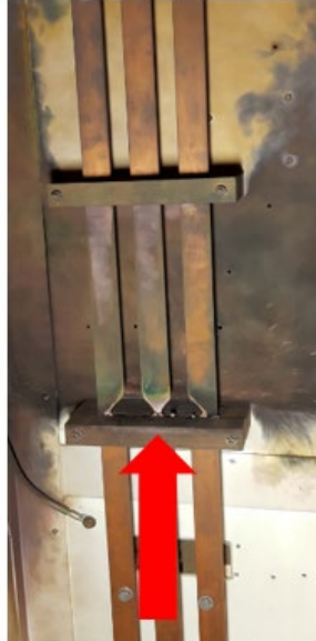
Panel rear view showing melted busbar