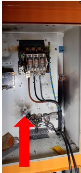
Panel front view showing drilled hole